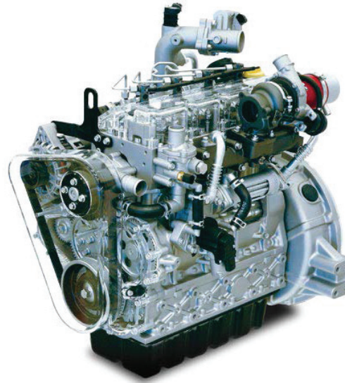
MODEL DTP24-I Industrial Engine